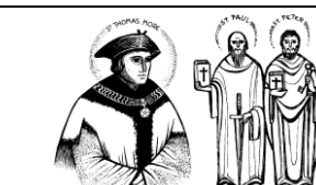
English Martyrs and Ss. Peter and Paul's