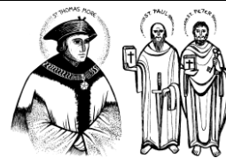
English Martyrs and Ss. Peter and Paul's