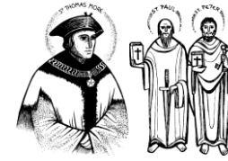
English Martyrs and Ss. Peter and Paul's