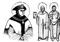
English Martyrs and Ss. Peter and Paul's