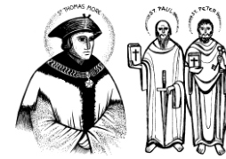
English Martyrs and Ss. Peter and Paul's