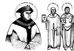
English Martyrs and Ss. Peter and Paul's