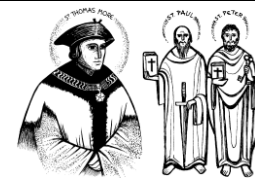
English Martyrs and Ss. Peter and Paul's